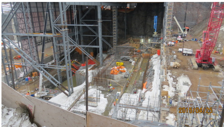
Intake work ongoing by Astaldi Canada