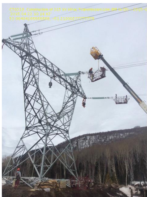
Valard workers placing a spacer cart on the conductor (wire) being strung on the HVac transmission line

Construction activities for the High Voltage alternating current (HVac) transmission line by Valard Construction continued to progress during the period with ongoing tower assembly, tower erection, foundation assembly and installation. By the end of April, 734 towers were assembled, 436 towers were erected, 599 guy anchors were tested, and 1,072 foundations were installed. At the end of the month, 53,708 metres of conductor stringing was completed.