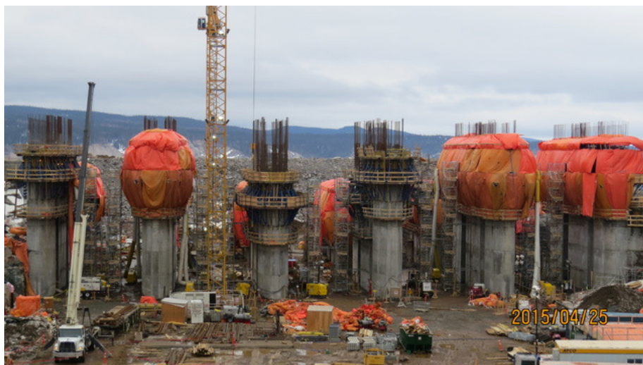
Concrete placement by Astaldi Canada on the spillway piers