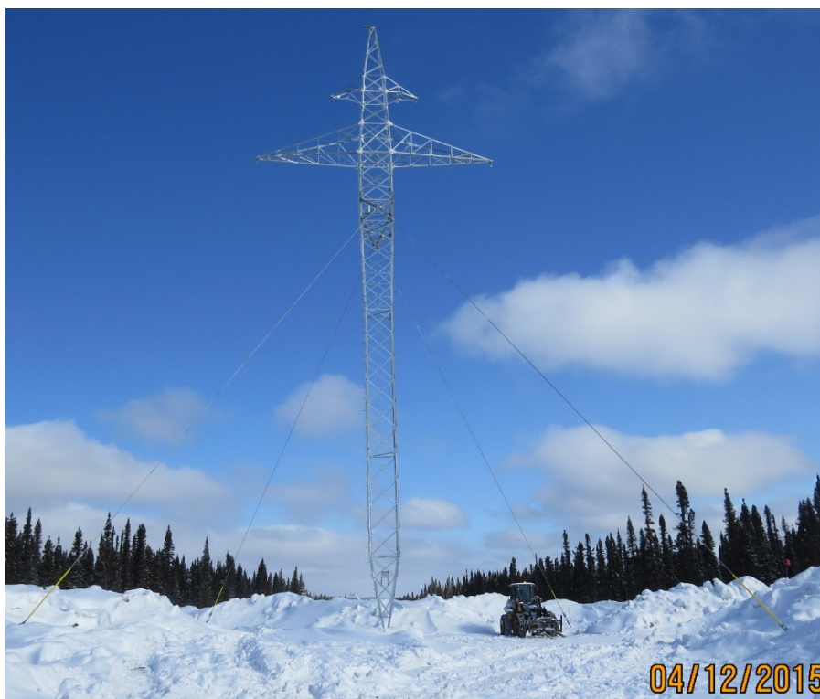
First HVdc tower erected on the Labrador-Island Transmission Link