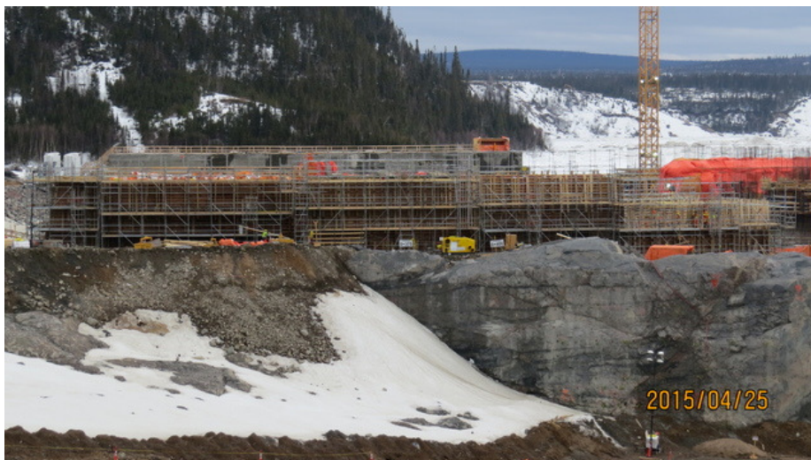
Separation wall work by Astaldi Canada

Other significant activities related to the Muskrat Falls generating facility include: